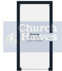
Floor -1 Building 1